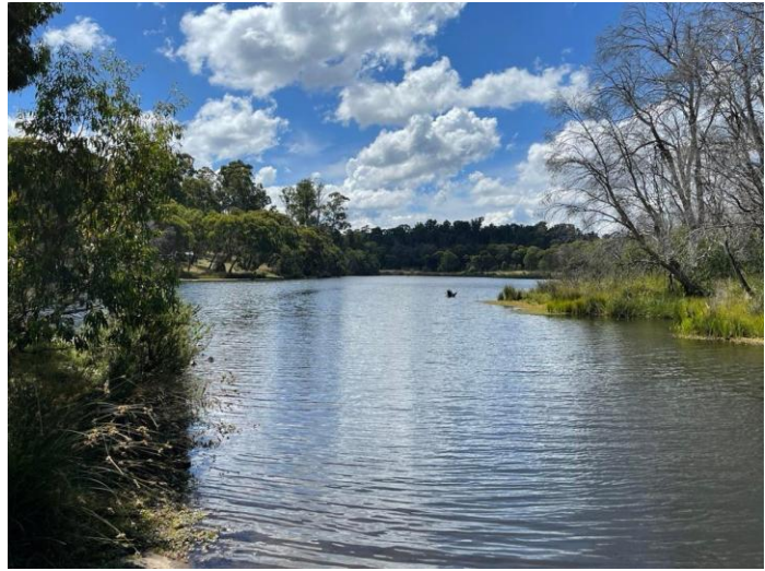
Paddy's River Dam located along the Hume and Hovell Walking Track in Bago State Forest.

Many tourists visit Tumbarumba, drawn by its natural beauty, proximity to the snowfields and a wealth of walking and cycling trails. These include the famed 'Tumbatrek', pictured below. It was pioneered in 1985 by the iconic, widely-liked Tim Fischer AC, Deputy Prime Minister at the time.