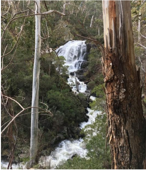
Buddong Falls located along the Hume and Hovell Walking Track in the Tumut area of Kosciuszko National Park.